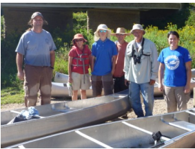
Project RED snapshot day

monitors at 28 sites. Six of these monitors are working around the Roth CAFO near Wauzeka, a cooperative effort with the Crawford Stewardship Project. A Quality Assurance (QA) Program was developed for both Level 1 & 2 and Sarah made QA visits to all currently active monitors. We purchased 2 new sets of electronic DO and pH meters and 5 new Level 1 water monitoring buckets through the WDNR Citizen Based Monitoring grant. Through the River Alliance of Wisconsin’s Project RED program we provided early detection for emerging aquatic invasive species. We held a training session and snapshot day where scouts canoed down the Kickapoo looking for invasives. VSN became involved with the Mussel Monitoring Program of Wisconsin by hosting a training day at the Kickapoo Valley Reserve. There were also educational sessions with the Youth Initiative High School Zoology class. WQM continues to provide monitoring and data analysis for the Karst