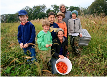
Gleaning at Ridgeland Harvest Farm.

Imagine opening your door to a group of children and parents singing “Bringing in the Sheaves” and then be handed a box of delicious organic vegetables that were harvested just yesterday. This was reality for the residents of Park View Manor this October. Forty residents participated in the Kickapoo Harvest Gleaning for Healthy Communities project this year and once again the project was a resounding success.