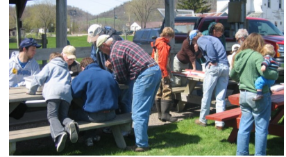
Water monitoring training in Viola.

2010 was definitely a busy year for the water quality program and as such we have many accomplishments to celebrate. There were 3 successful water quality monitoring trainings: Wilton, Viola and Steuben resulting in 9 new monitors. We currently have 32 consistent water quality