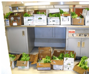
Fresh Veggie Boxes.

The myth of scarcity fades more and more as I visit farms, harvest a bounty of fresh and delicious produce and have so much left over that I end up driving around giving it to my neighbors and friends after I have packed 40 boxes for Park View Manor residents. There is plenty to go around; that is not the problem. The challenge is in how we get it from the field to the kitchens of people who need it. This gleaning project is starting to bridge that gap but it cannot grow beyond 40 boxes at Park View Manor simply as a volunteer led project.