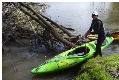
Oh! The log jams.

Day 7 of the VSN Voyage saw the paddle voyage come to an end. High water finally caused us to stop the trip. Safety first! Many bridges were not passable.