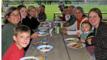
Potluck in Readstown

Day 4 of the VSN Voyage, Viola to Readstown, was a lot of fun. This stretch also had a lot of logjams. The day ended with a great “Nourish the Voyageur Potluck” in Readstown Village Park. Unfortunately, with a looming thunder-filled rain forecast, even hail, for the evening and next day, we were required to go home for the night. 46 miles completed.